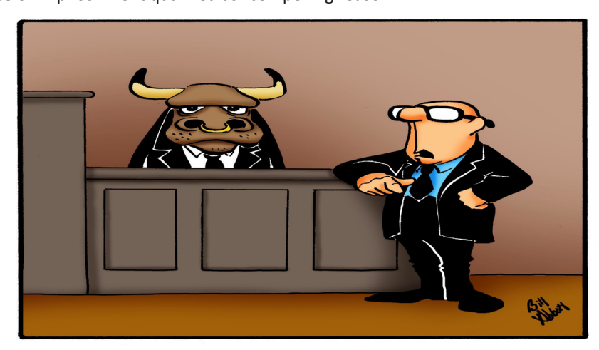
"Don't deny it, Mr. Bull. We have a reliable witness who says you were indeed in the China shop."

A factor that might be considered exceptional by a court considering a bail application is an unreasonable delay in the commencement of a trial. In cases where the accused is able to demonstrate that the delay amounts to an exceptional circumstance, the court may order the accused to be released on bail instead of continuing to be held on remand. In Re Johnstone (No 2) [2018] VSC 803, the Supreme Court held, for example, that delays causing remand to be longer than any possible sentence of imprisonment qualified as "compelling reason."