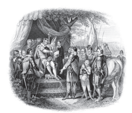
King John signing the Magna Carta

To no one will we sell, to no one deny or delay right or justice.